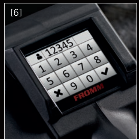
[6] Locking of the Tool settings