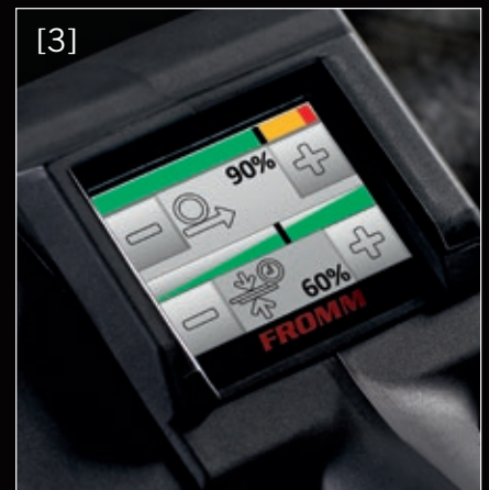
[3] Tension force and Welding time