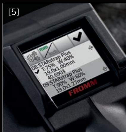
[5] Strap database