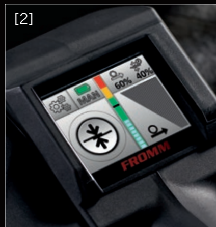
[2] Advanced mode