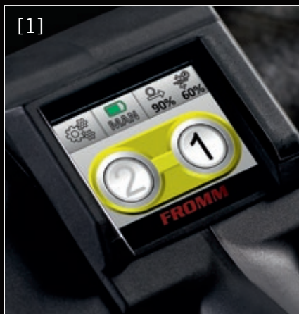
[1] Classic mode

Easy to operate with factory gloves of all kinds!