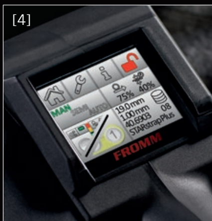
[4] Settings menu